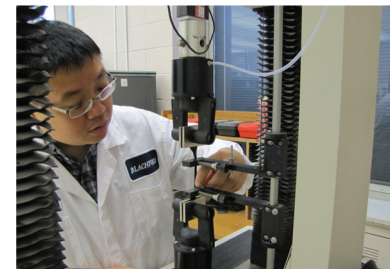
Superior Batch Uniformity