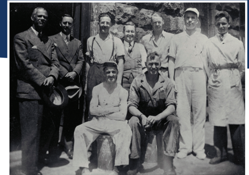
90 Years Industry Experience