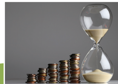
Reduced Processing Time